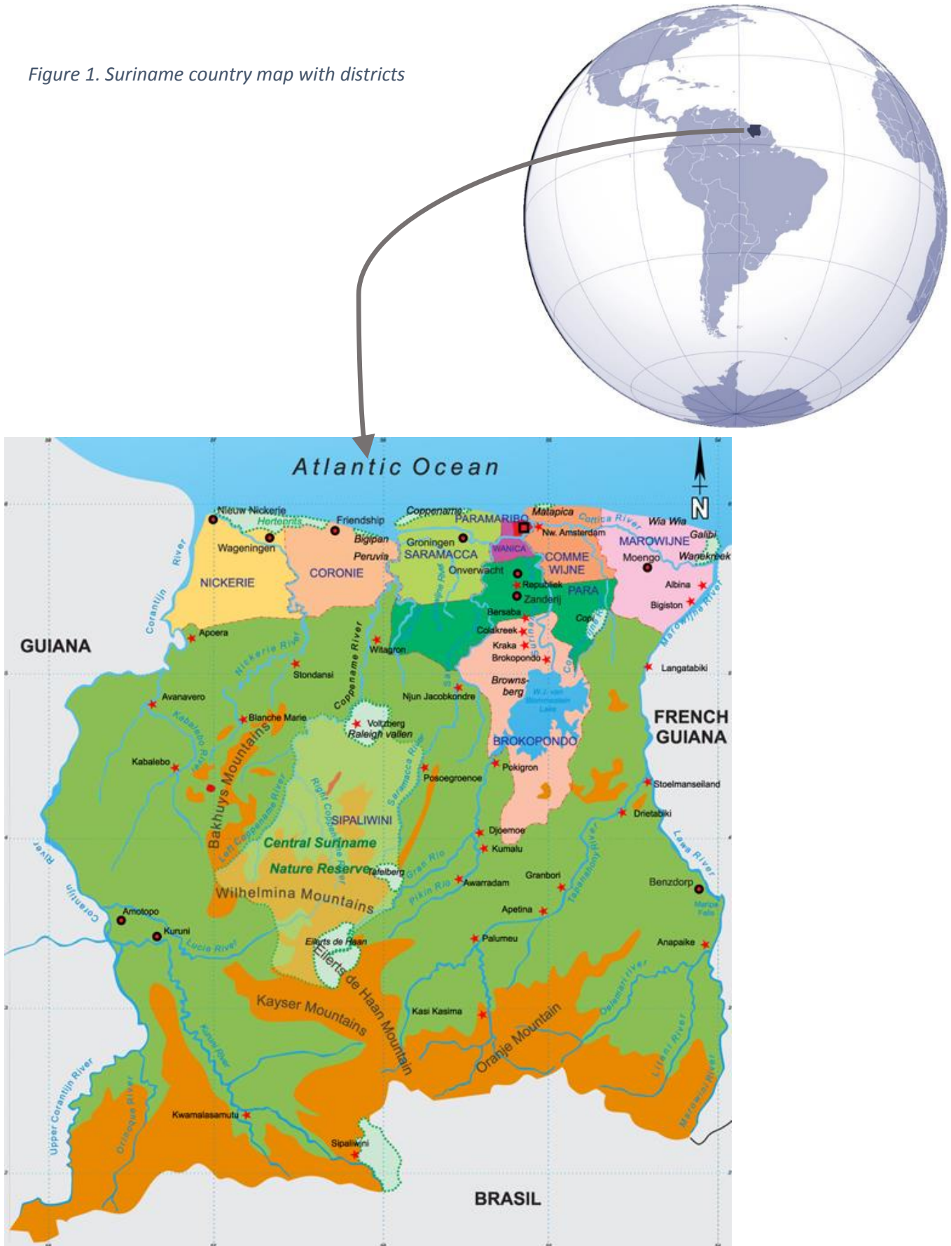
Figure 1. Suriname country map with districts